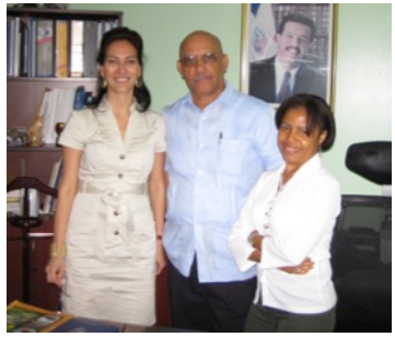
Meeting with Director of CODOPESCA