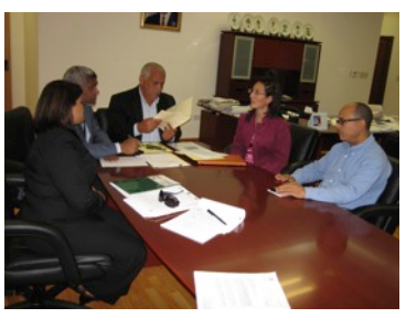
Meeting with Environment Minister of the Dominican Republic