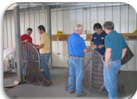
Learning to assemble TEDS

For details on how to become and approved IAC observer please go to our website http://www.iacseaturtle.org/English/acerca_obs.asp