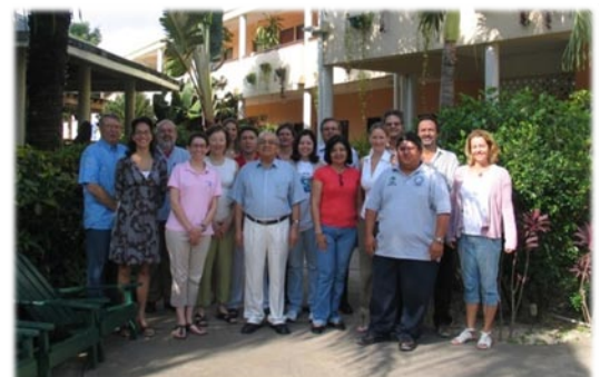
Members of the CCE during its 3 rd Meeting in Belize.

The IV Regional Symposium on Sea Turtles in the South Eastern Pacific will be held from November 25-26, 2010, in Medellin, Columbia. For more information please visit their website (in Spanish only): www.iicongresocolombianozoologia.org