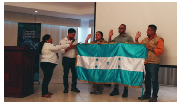
HONDURAS SEA TURTLE COMMITTEE BOARD

The meeting was a rich technical exchange with sea turtle conservationists from Honduras (Pacific and Caribbean) to learn about the ongoing work on the IAC index nesting sites, the current status of the conservation of five sea turtle species, and to agree in a more efficient mechanism to share information from the nesting beaches among the members of the COTTOM to include in the IAC report. The Honduras Secretariat of