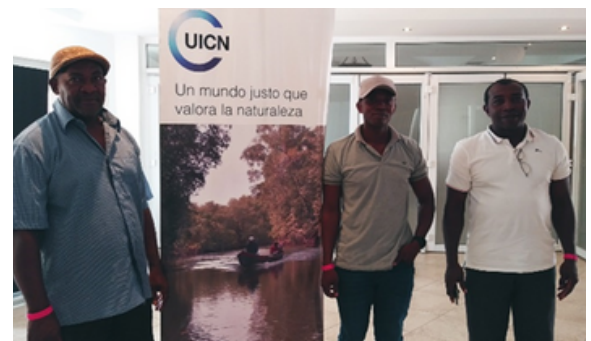
FISHERMAN FROM THE COCALITO COMMUNITY