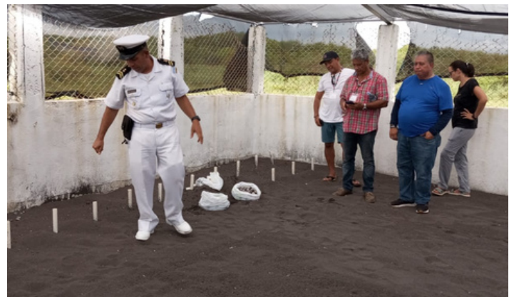
SEA TURTLE HATCHERY MANAGED BY GUATEMALAN NAVY. LOCATION PUERTO SAN JOSÉ, ESCUINTLA- GUATEMALA