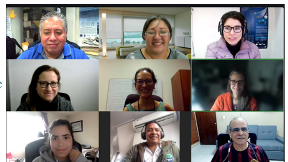
WG - FISHERIES