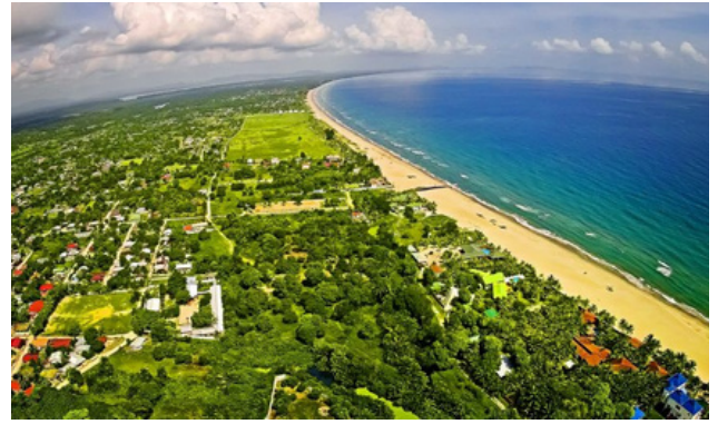
BEACH OF HONDURAS