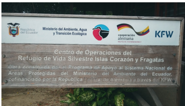
SIGN AT ISLA CORAZÓN

The IAC Secretariat visited the Wildlife Refuge Isla Corazón y Fragata in Ecuador on June 17 to learn about the experiences from the park rangers about the process that lead to the successful incubation ex-situ of the first East Pacific Leatherback nest. The park rangers full time dedication guided by IAC Scientific Committee members from Ecuador and Mexico resulted in the first successful leatherback hatchlings release in continental Ecuador.