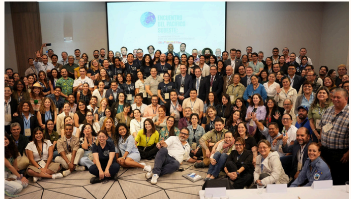
GROUP PICTURE