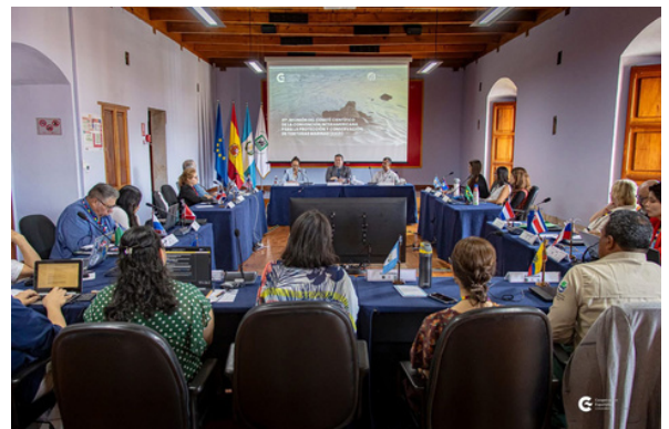
SCIENTIFIC COMMITTEE 21 PLENARY -AECID