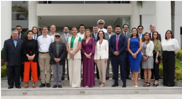
COP11 GROUP PICTURE