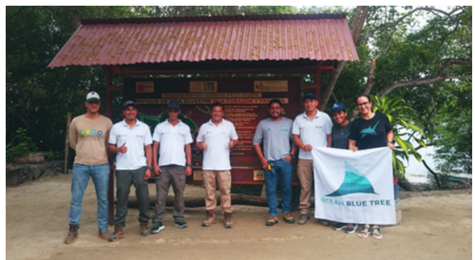
ISLA CORAZÓN PARK RANGERS