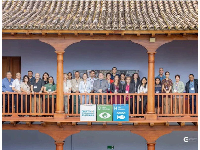
SC21 GROUP PICTURE - AECID

August 21, 2024 (Virtual), August 27-29, 2024 (In-Person) La Antigua, Guatemala