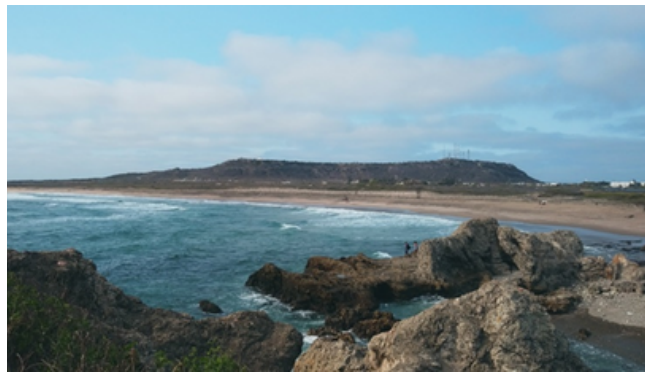
INDEX NESTING SITE: ECUADOR – PUNTA BRAVA