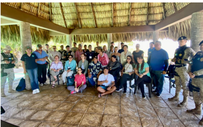
IAC SCIENTIFIC COMMITTEE DURING A VISIT TO GUATEMALA SEA TURTLE HATCHERIES