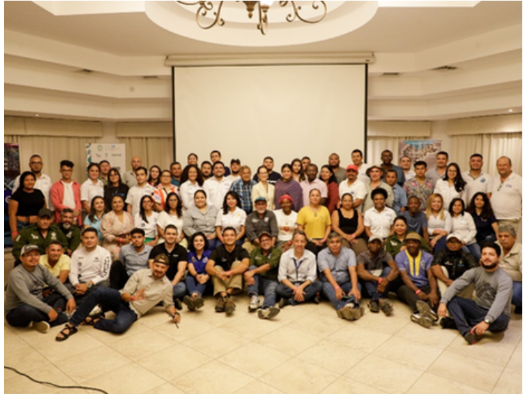
COTTOM GROUP PICTURE